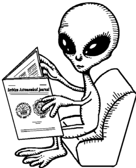
Fig. 2. This is an example of a small figure.

Table 2 shows the number of articles published in SerAJ, number of cites to articles published in